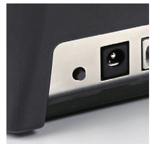
Innovative "C" button makes label Calibration simple and fast