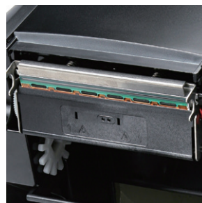
"Twin-Sensor" technology allows you to use a broad range of labels