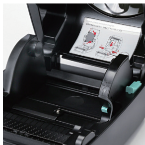
Rod-less label roll holder for easy loading and smooth feeding