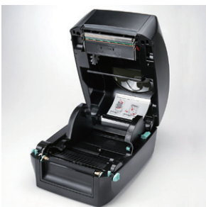
Modern clam-shell design makes it simple to load labels

Advanced multi-purpose 4" desktop printer for light to medium duty applications. With its powerful and reliable features, RT700 is the best choice for retail and industrial applications