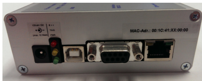
Interface-connectors of the SIL-9200-MUX4 UHF LongRangeReader-System