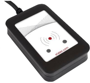
Desktop version (inlay customizable)

Elatec's TWN4 family of transponder readers and writers allows users to read and write to almost any 125 kHz, 134.2 kHz and 13.56 MHz tags and/or labels. It supports all major transponders from various suppliers like ATMEL, EM, ST, NXP, TI, HID etc. and ISO standards like ISO14443A/B (T=CL), ISO15693, ISO18092 / ECMA-340 (NFC).